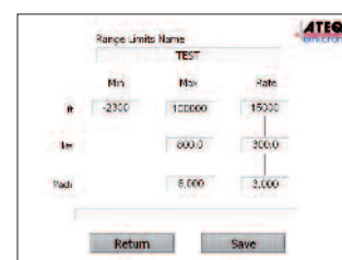
Typical screen display