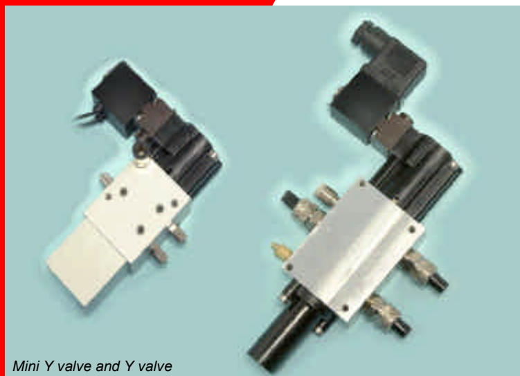
Mini Y valve and Y valve

Y valves are 3/2 spring recoil valves with pneumatic or electro-pneumatic control. They are leak proof with internal pressurisation on the mini Y valve.