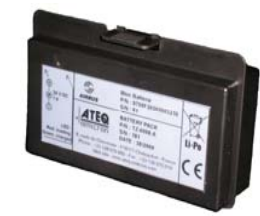
TZ-0098-A : Battery pack