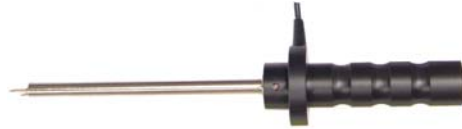
EG-0263-A : 150 x 10 Kelvin probe