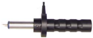
EG-0267-A : 50 x 17 Kelvin probe