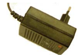
E5-0014-A : AC / DC Adaptor