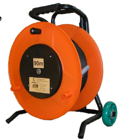
EG-0261-A : 50 m cable on cable reel EG-0059-A : 90 m cable on cable reel