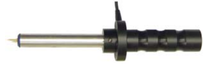
EG-0268-A : 100 x 17 Kelvin Probe