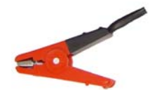
EG-0264-A : Medium kelvin clip