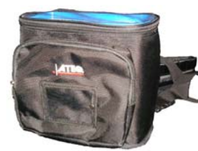
MB-0151-A : Front-bag