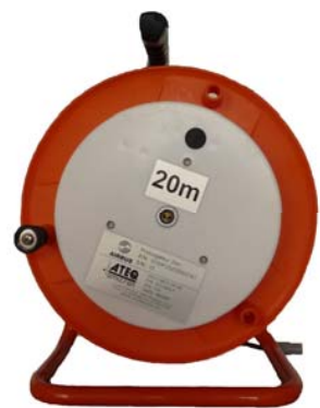
EG-0260-A : 20 m cable on cable reel