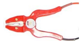
EG-0270-A : Strong kelvin clip