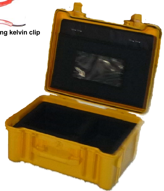
MB-0151-A : Yellow case