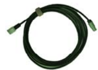
EG-0257-A : 5 m cable